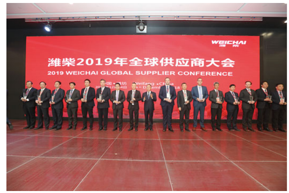
Venue of the Weichai Commercial Conference 2019