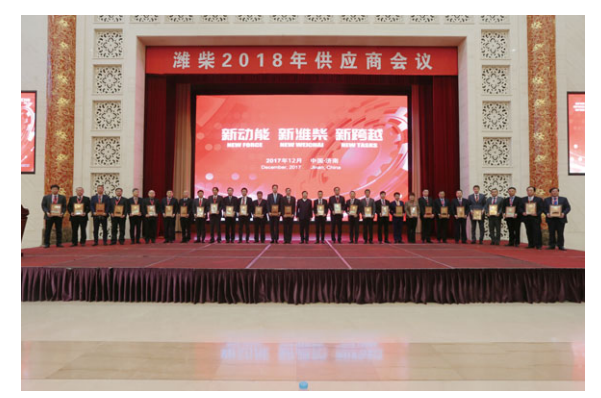
Venue of the Weichai Commercial Conference 2018