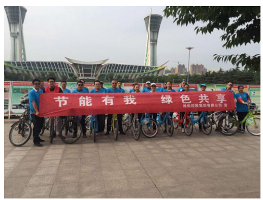
Voluntary advocating activity named "We Save Energy, We Enjoy Green Environment" (節能你我,綠色共享)

In 2017, the Company's young volunteers launched a voluntary activity named "Leifeng Day" (雷鋒日), a green experience activity named "Upholding Low-carbon Concept and Embracing Green Life" (樹立低碳理念·擁抱綠色生活), a charitable and healthy walkathon activity named "Jumped-up Charity for Genuine Happiness" (躍公益·悦幸福), a voluntary activity named "My Dating with Compact Discs" (我與光盤有個約會), Civilized Car-parking Initiatives (文明停車倡導), an activity named "Be the Pioneer in Treasuring Water, Cherishing Water, Conserving Water" (愛水惜水節水·從我做起), a voluntary advocating activity named "We Save Energy, We Enjoy Green Environment" (節能你我·綠色共享) and so forth, participated in a winter clothes-donating event named "Warming Your Heart" (溫暖你的心) held in Weifang, and social charitable activities such as cultural trips as well as cultural and artistic performances etc. In 2017, our young volunteers served for a total of more than 28,000 hours.