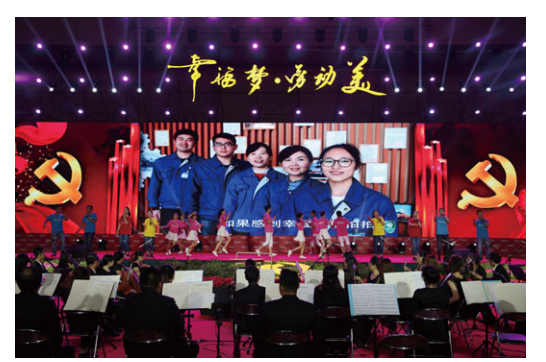
"Happiness Dream, Work Beauty" (幸福夢•勞動美) staff singing contest

On the occasion of "1 July", a singing contest with the theme "Happiness Dream, Work Beauty" (幸福夢•勞動美) staff singing contest in celebration of the 96th anniversary of the founding of the Communist Party of China was organized, where 15 teams totalling 5,000 staff members took part and demonstrated the passion of Weichai's staff.