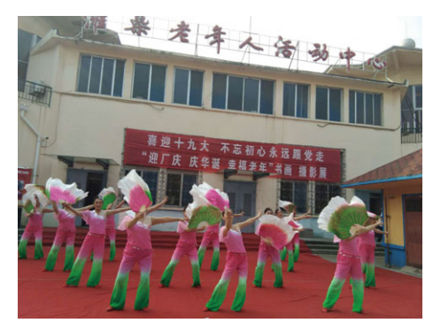
Comprehensive cultural activities for old workers

Claims for medical expenses were filed on behalf of retiring cadre members and elderly workers born before year 1949 free of charge. 42 sessions of cultural and sports activities and free-of-charge medical consultation were organized for elderly workers. We also visited and touched base with old workers for 352 times; celebrated old workers' birthday for 221 times; and handled old workers' funeral affairs for 161 times.