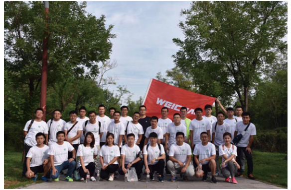
Charitable and healthy walkathon activity named "Jumped-up Charity for Genuine Happiness" (躍公益·悦幸福)